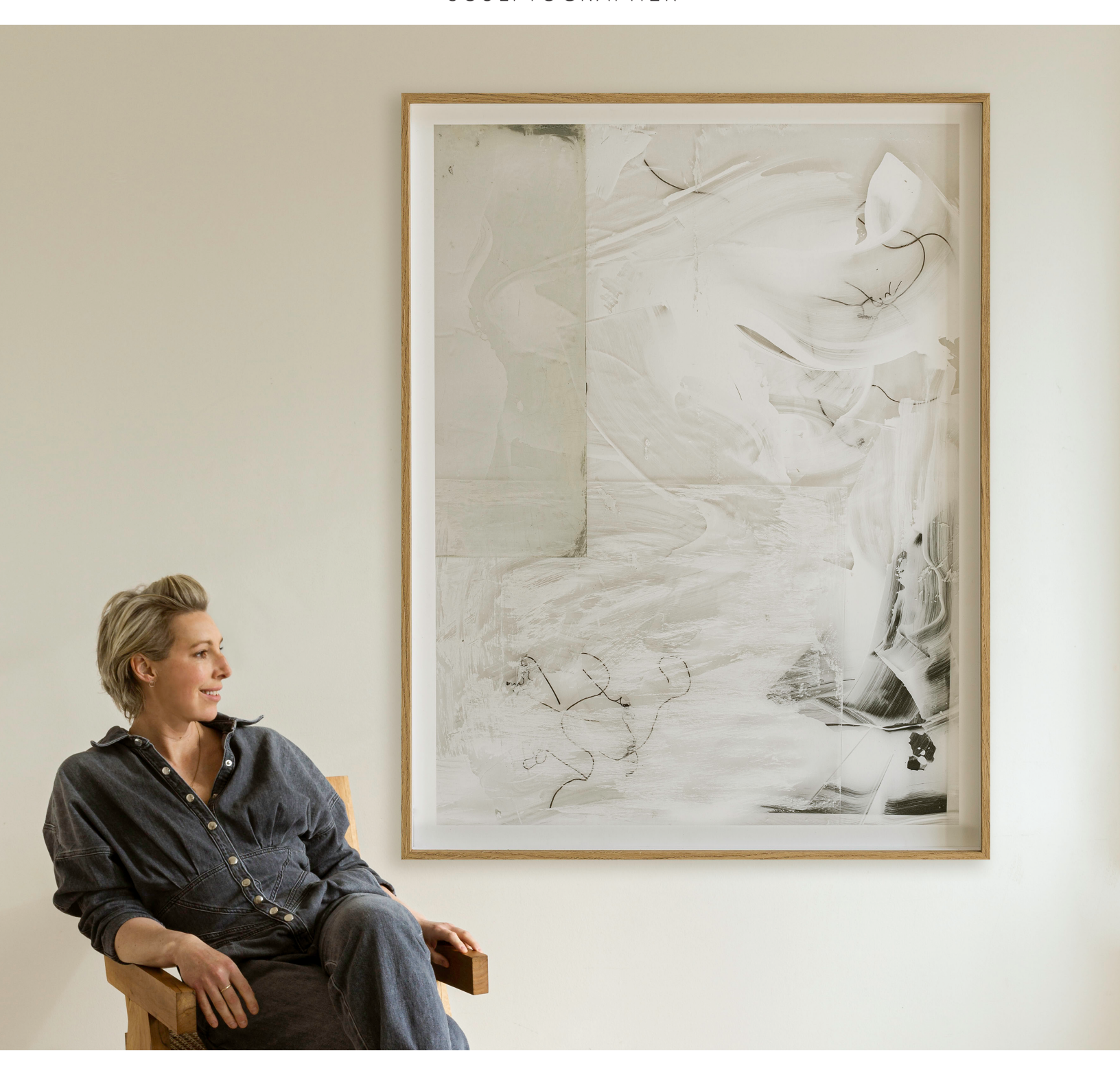
Chapter 4 - in the Nuances