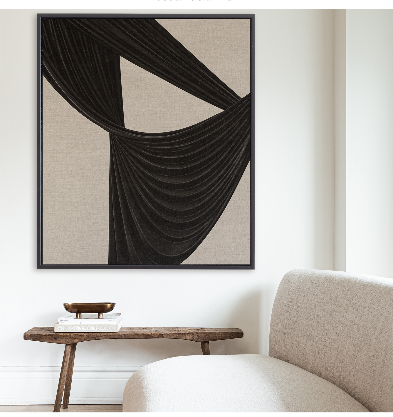
Ebb & Flow